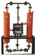
Heat less Air Dryer