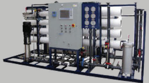
REVERSE OSMOSIS PLANTS

“Reverse Osmosis” (R.O) is the most economical and efficient method of separating dissolved solids and minerals present in water. R.O involves an ionic exclusion process, where, only Solvent, i.e water molecules allowed to pass through a semi permeable R.O membranes under pressure and all ion and dissolved molecules are retained as rejects. AB make R.O plants use world’s most reputed RO membranes for best and trouble free performance for years.