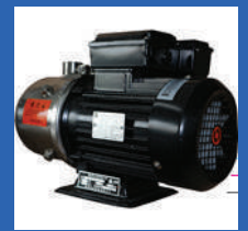
Stainless Steel Pumps for longer life ensuring almost "ZERO" breakdown.