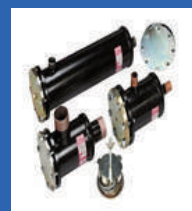
Filter Dryers for smooth trouble free operations