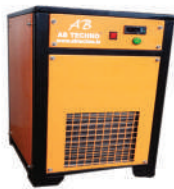
Refrigeration Air Dryer