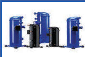
Emerson/ Danfoss make Recip/ Scroll/ Screw Compressor for most efficient chilling